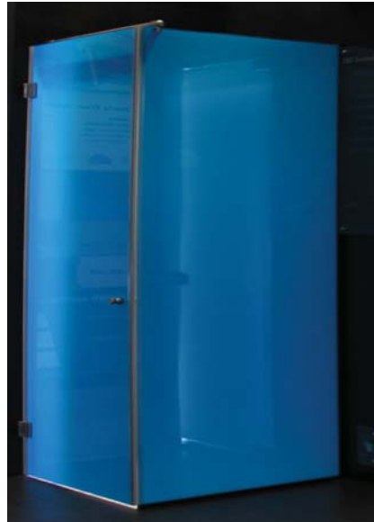
ESG Switchable™ Power off at Self Build Center

ESG Switchable™ can be used to open up small bathrooms through increasing the levels of light and space - thus creating a much more pleasant ambience for users. This makes our privacy glass the preferred choice for use in small hotel bathrooms as well as in larger areas as a modern design feature.