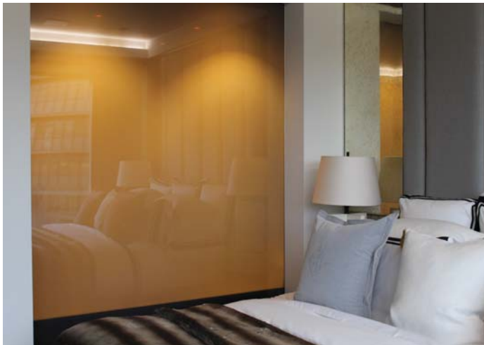
ESG Switchable™ with bronze tint - Power Off