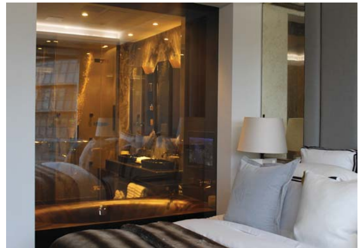
ESG Switchable™ with bronze tint - Power On