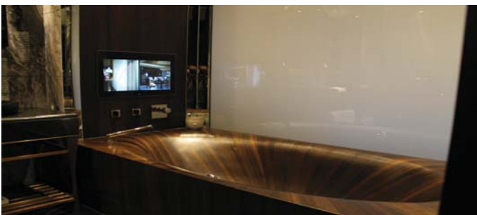
ESG Switchable™ Power Off at One Tower Bridge, London