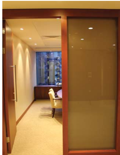
ESG Switchable™ Power off