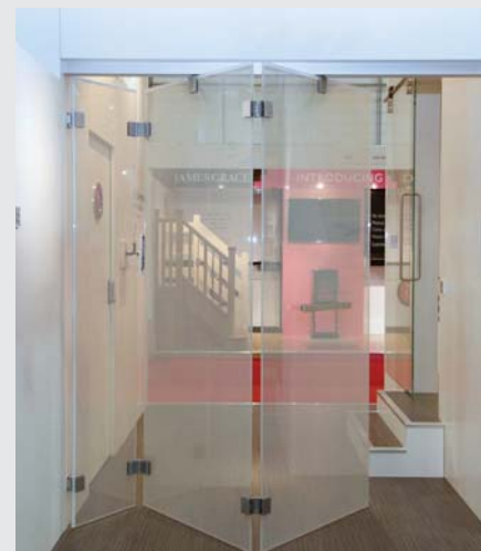
ESG Switchable™ Power on

For more ideas on applications, please visit www.esg.glass