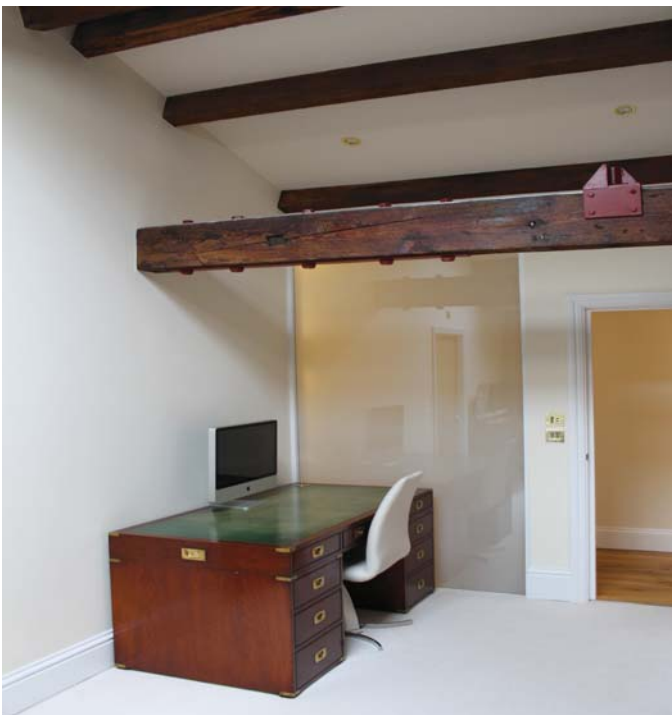
ESG Switchable™ Power Off in a Penthouse, London

Our products are tested in house and by Europe's leading independent, third-party certifiers and testers such as BRE and the British Standards Institute which distinguish our products and services from our competitors, and gives you, our customers, confidence about their performance.