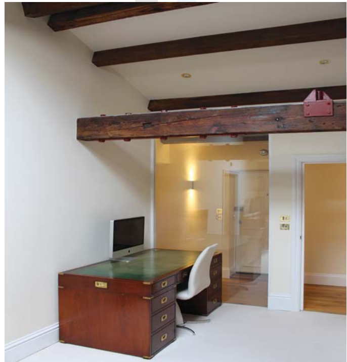
ESG Switchable™ Power On in a Penthouse, London

For full information regarding our products and relevant standards they comply with please visit our website www.esg.glass