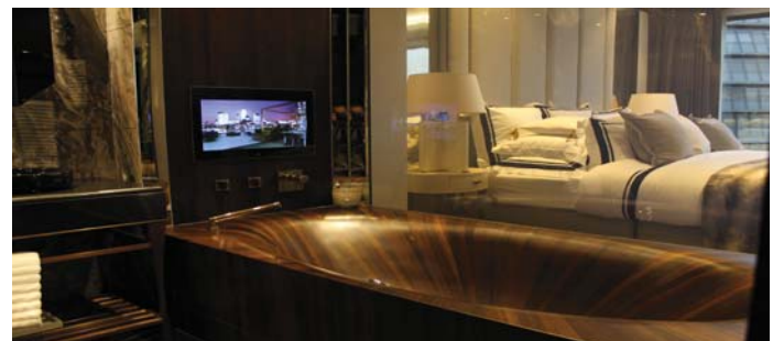
ESG Switchable™ Power On at One Tower, London