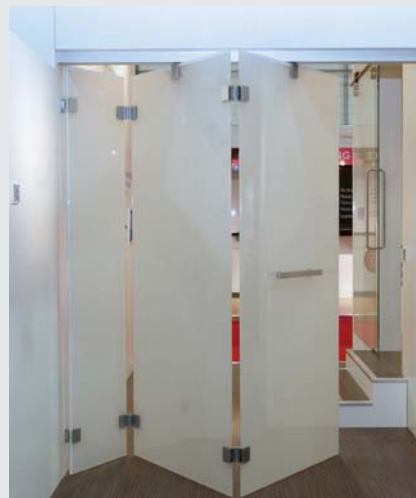
ESG Switchable™ Power off