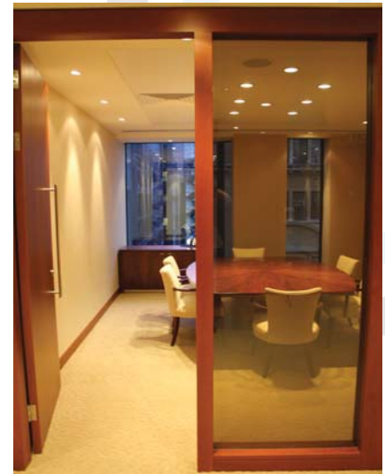
ESG Switchable™ Power on