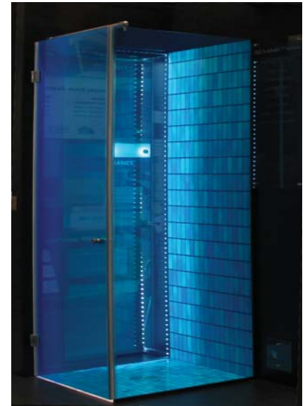
ESG Switchable™ Power on at Self Build Center