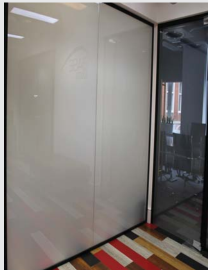
ESG Switchable™ - Power off