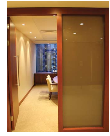
ESG Switchable ^{\scriptscriptstyle\mathsf{TM}} Power off