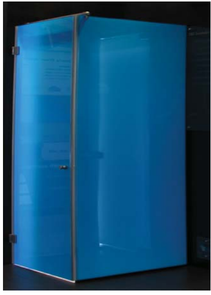
ESG Switchable™ Power off at Self Build Center

ESG Switchable™ can be used to open up small bathrooms through increasing the levels of light and space - thus creating a much more pleasant ambience for users. This makes our privacy glass the preferred choice for use in small hotel bathrooms as well as in larger areas as a modern design feature.