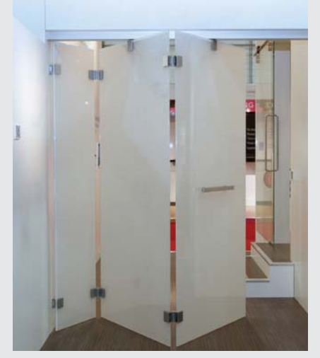
\mathsf{ESG}\ \mathsf{Switchable}^{\scriptscriptstyle\mathsf{TM}}\ \mathsf{Power}\ \mathsf{off}

ESG supply, and can install, the complete system incorporating ESG Switchable™ LCD Privacy Glass, low voltage track and conductive fittings with accompanying electrical control technology.