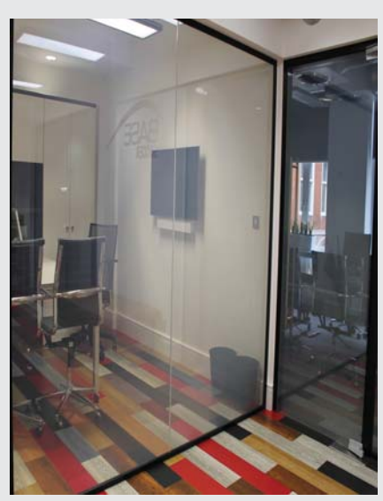
ESG Switchable™ - Power on