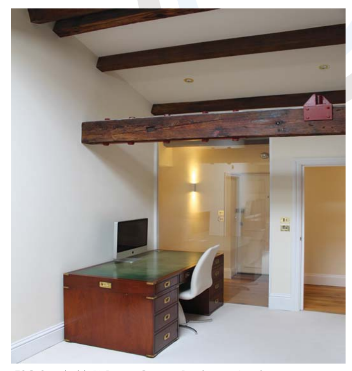
ESG Switchable ^{\scriptscriptstyle{\mathsf{TM}}} Power On in a Penthouse, London

Our products are tested in house and by Europe's leading independent, third-party certifiers and testers such as BRE and the British Standards Institute which distinguish our products and services from our competitors, and gives you, our customers, confidence about their performance.