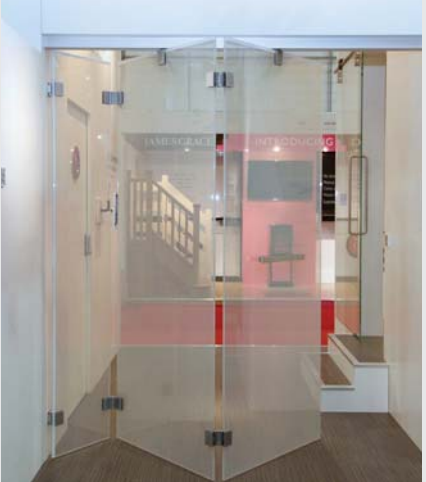
ESG Switchable™ Power on