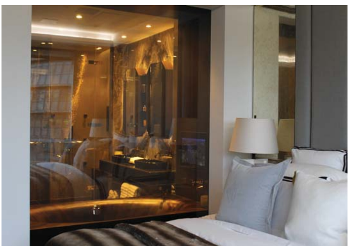
ESG Switchable ^{TM} with bronze tint - Power On