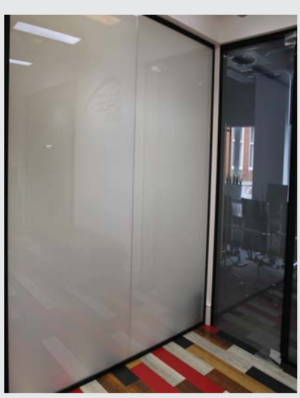
ESG Switchable ^{\scriptscriptstyle\mathsf{TM}} - Power off