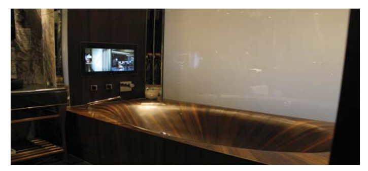
ESG Switchable™ Power Off at One Tower Bridge, London