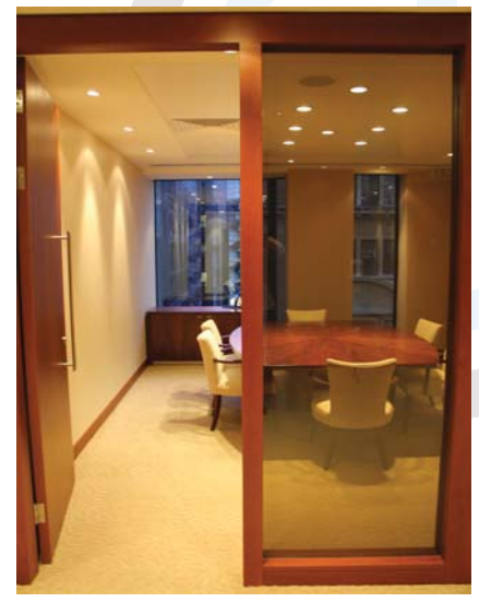
ESG Switchable™ Power on